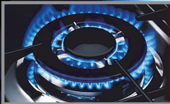
Clean burning flame.