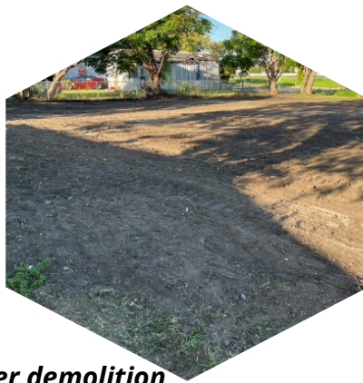
before & after demolition